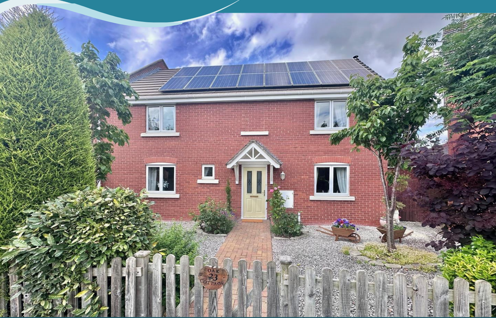
'OAK COTTAGE', 23 MYTTON DRIVE | NANTWICH | CHESHIRE | CW5 5UF | OFFERS IN THE REGION OF £319,000